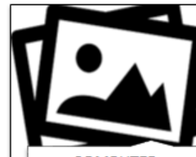
COMPUTER GENERATED IMAGES