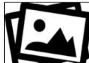
COMPUTER GENERATED IMAGES